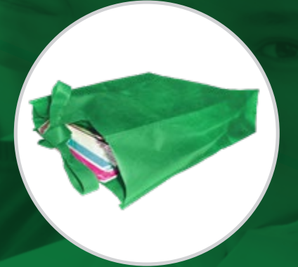
NON WOVEN BAG Re-usable Multi-purpose Available in 7 colours