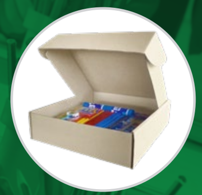
BOX Stackable Recyclable