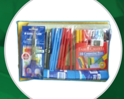
ZIP LOCK BAG Contents can be viewed easily through packaging